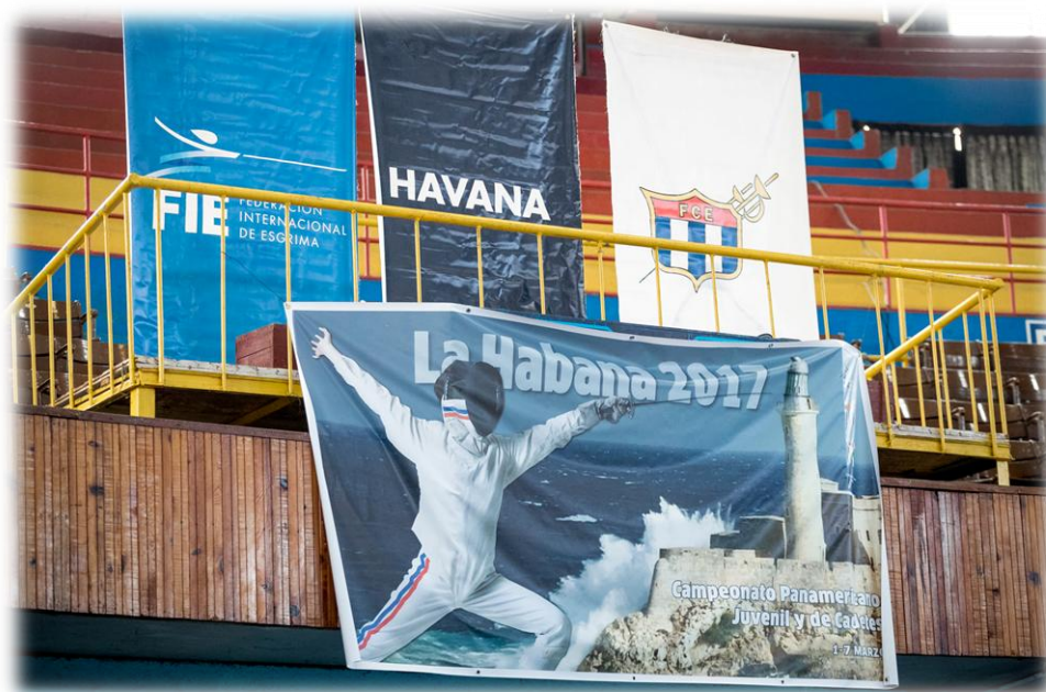
Pan American Junior and Cadet Championship Havana, 2017