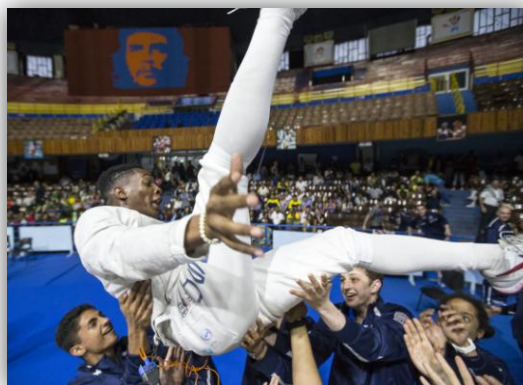
Celebration of the United States Team