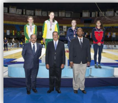
Protocolary Awards Ceremony of the Junior Women's Foil