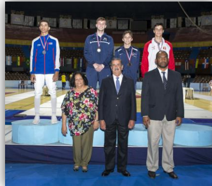
Protocolary Awards Ceremony Individual Junior Men's Epée