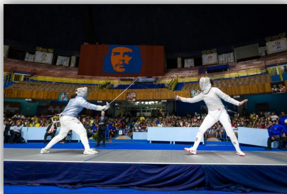
The Puerto Rican and Mexican Finalists