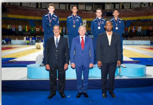
Protocolary Awards Ceremony of the Junior Men's Foil